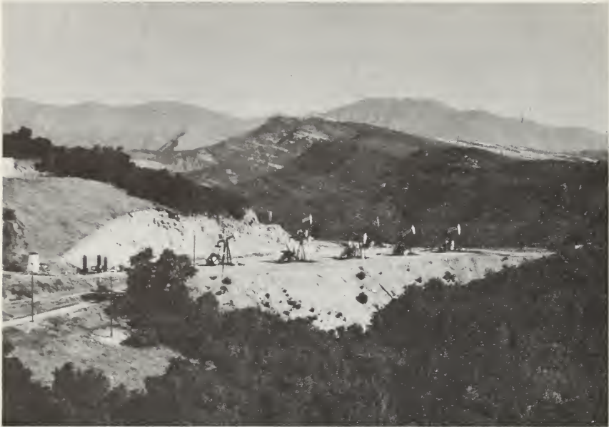
Fig. 9. Oil field development at the edge of the Sespe Condor Sanctuary. Condors formerly roosted along the ridge immediately behind the pumps.

1 km (0.6 mile) away in line of sight of the roost trees, and there is almost constant, but usually low-level, noise and oil-related activity. Condors no longer roost on the west side of Hopper Ridge in that area, although they continue to roost within 2 km (1.2 miles) of the oil operation where roosts are shielded topographically from sight and most sound of the oil fields (Fig. 9).